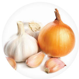
Onion & Garlic